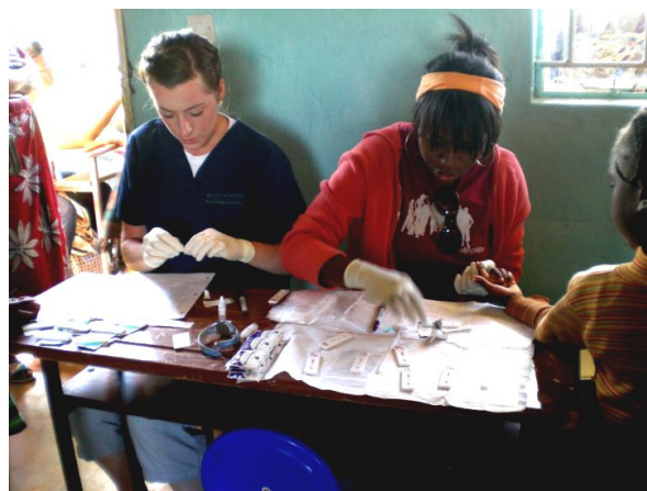
Two NPU nursing students screen children for malaria.

The plan was to develop a research study while testing and treating students for malaria at Hope Community School. This school has a partnership with Spark Ventures in Chicago which strives to help vulnerable children in Zambia reach their potential.