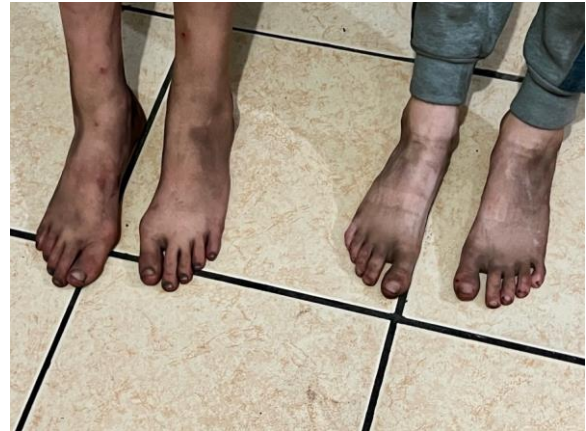
Feet after playing in Mongu. (This is the norm.) Time for a bath!